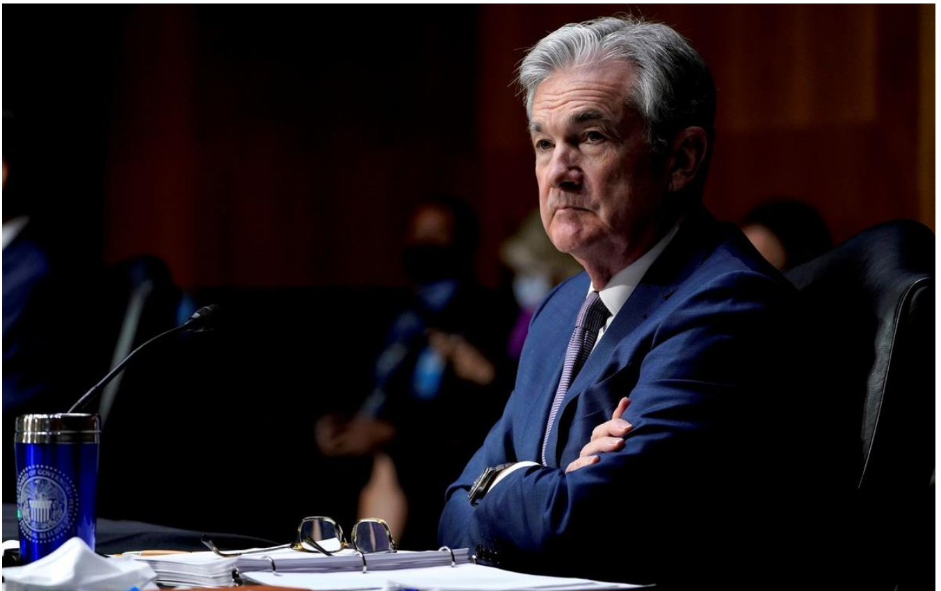
Jerome Hayden Powell is the 16th chair of the Federal Reserve

Powell also stated, "The dots are not a great forecaster of future rate moves ... it's because it's so highly uncertain. There is no great forecaster -- dots to be taken with a big grain of salt," he said. (Source: www.cnbc.com 06/16/2021)